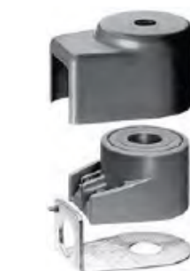
Ref. 4270 - Protection IP 44