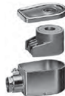
Ref. 4538 - Protection IP 67